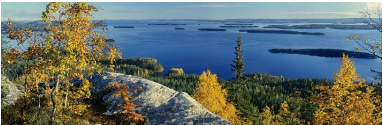
A view from Koli National Park in autumn

Inside the Joensuu Arena there is map on the floor representing world forest areas. Forest will be brought to here as images, lights, sounds etc. In the middle of arena ( Congo on the map) there is a tall "tree" that extends to top of building. This tree will be a gathering place for people.