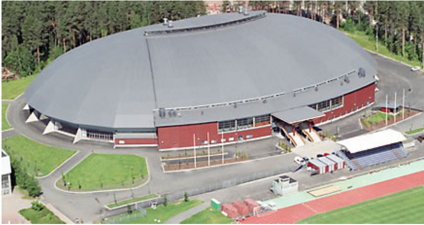
The Joensuu Arena, Finland